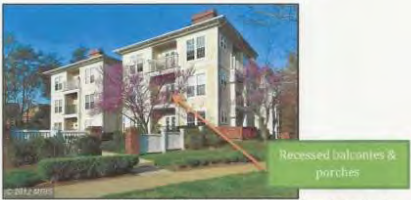
Illustration - Example of Building Scale and Character Standards