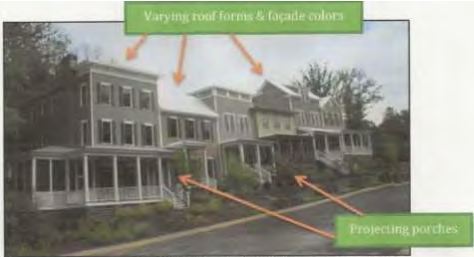
Illustration - Example of Building Scale & Character Standards